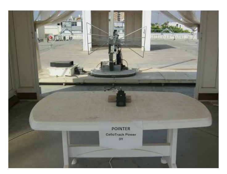
Figure 3. Radiated Emission Test